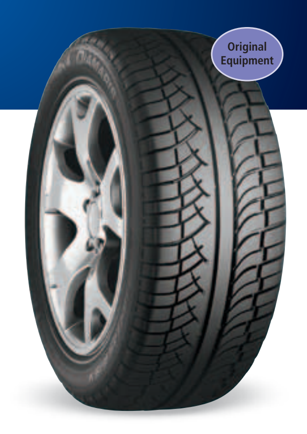
Original Equipment Fitments:

Most performance Crossovers and SUVs. Available in 19- and 20-inch sizes with V- and W-speed ratings.